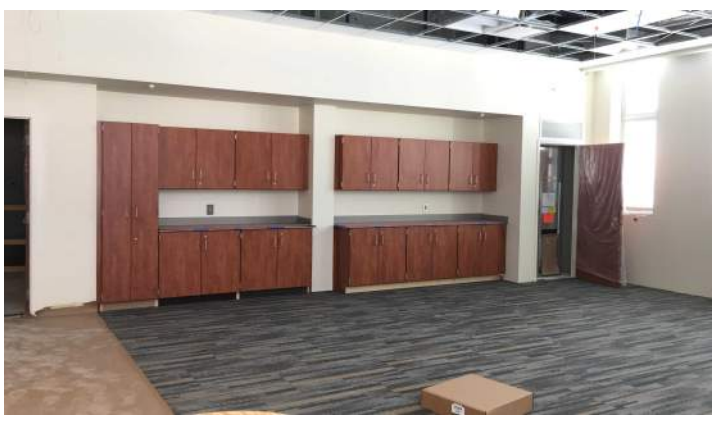
Carpet Tile Installation in Area A 3rd Floor