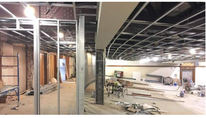
Metal Stud Framing in Area G Auditorium Cedar Level