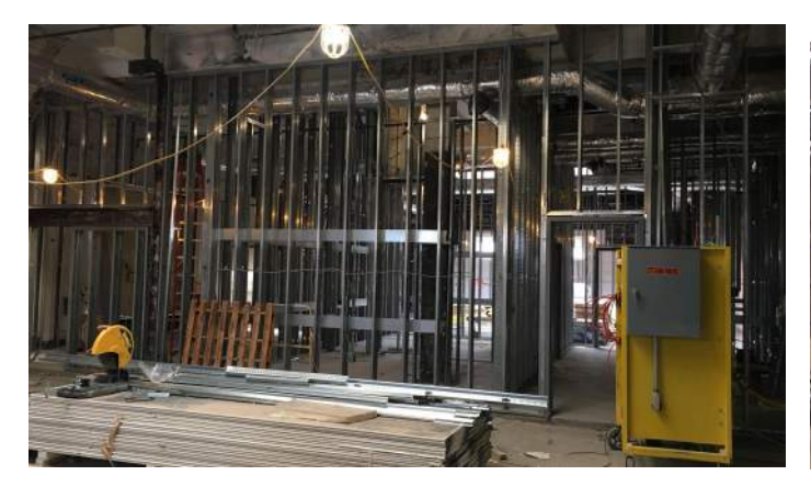
Metal Stud Framing in Area G Vocal Level