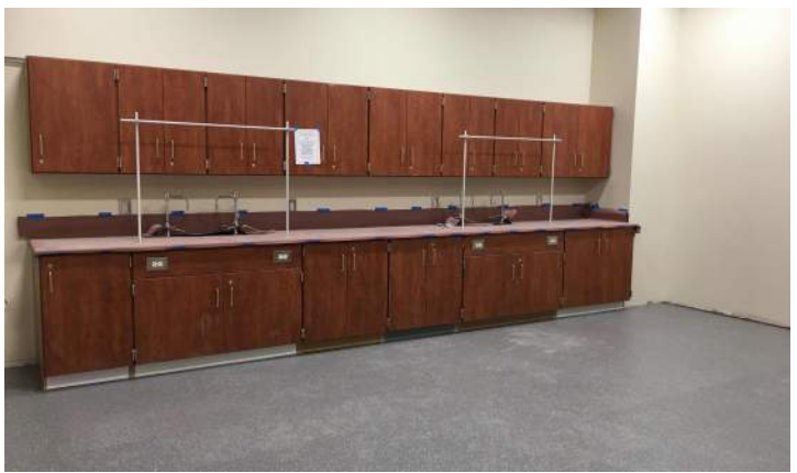
Rubber Flooring Installation in Area A 3rd Floor