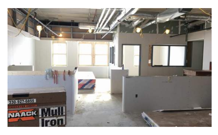
Drywall Installation in Area F Cedar Level