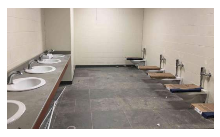
Sink & Toilet Installation in Area A 3rd Floor